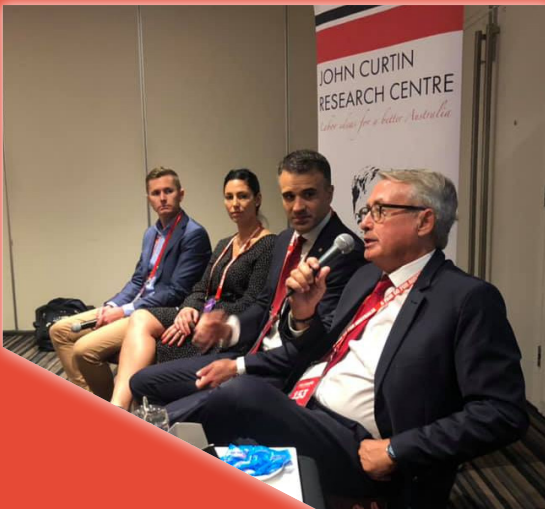
▲ ALP National Conference Fringe Adelaide