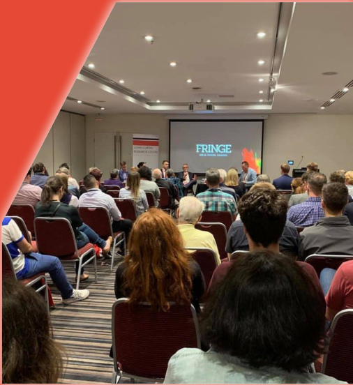
◀ ALP National Conference Fringe Adelaide ▶

Take a look back at highlights from our recent events.