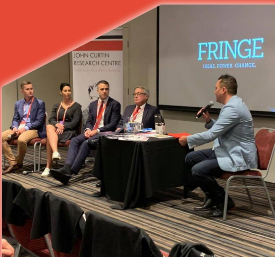
◀ ALP National Conference Fringe Adelaide